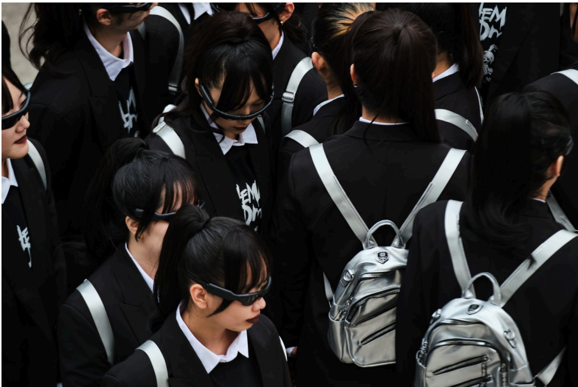
Lord of the Flies , 2022 (performance view, opening of Where Jellyfish Come From , Antenna Space, Shanghai, 8 January 2022). Courtesy the artist and Antenna Space, Shanghai