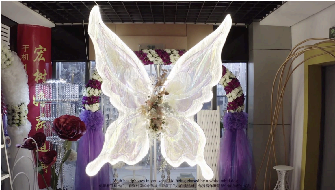
I Want to Sleep More but by Your Side (still), 2019, video, colour, sound, 25 min 26 sec.